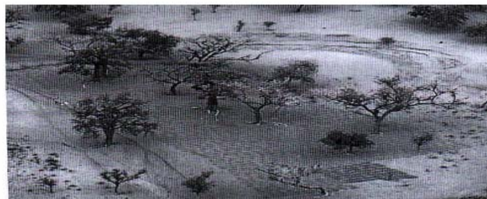
Plate 5. Agricultural plot, shaded by trees, in the Dogon Region, Mali