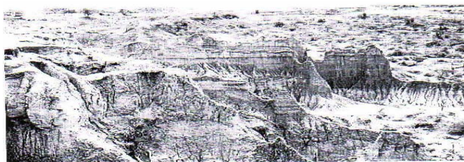
Plate 1. Shows wind and water erosion extensive in many parts of Africa, placing millions of peasant farmers at risk of food insecurity

Land degradation and reduced productivity can be categorized as: hydrological and chemical degradation, physical degradation and biological degradation. Hydrological and chemical degradation encompasses waterlogging, salinization, sodication and chemical pollution and industrial pollution. Physical degradation includes deterioration of soil structure and the occurrence of compacted layers that can be due to overstocking, inappropriate use of machinery, mining and quarrying activities, frequent waterlogging and exposure to erosion. Biological degradation refers to the loss of nutrients and microorganisms vital for maintaining healthy productive crops and is due to exhaustion of soil fertility as a result of intensive cropping, removal of crop residues, nutrient deficiencies and insufficient organic matter.