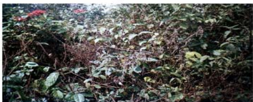
Plate 4. Three years fallow