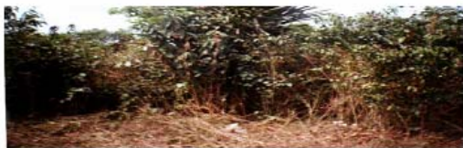
Plate 3. Two years fallow