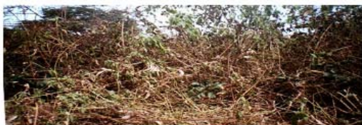
Plate 2. One year fallow